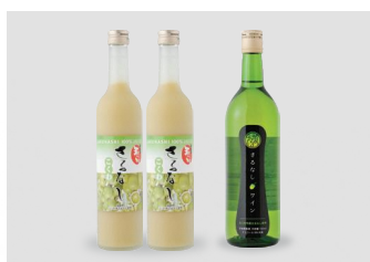
100% Sarunashi Juice / Sarunashi Wine